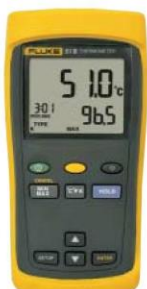
Fluke 51 II