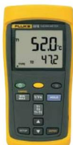
Fluke 52 II