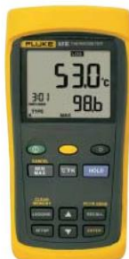
Fluke 53 II