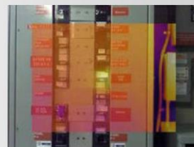
50% blending, picture-in-picture mode