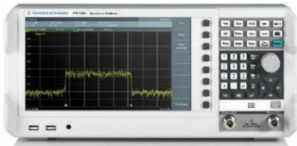
More than a spectrum analyzer Value of three